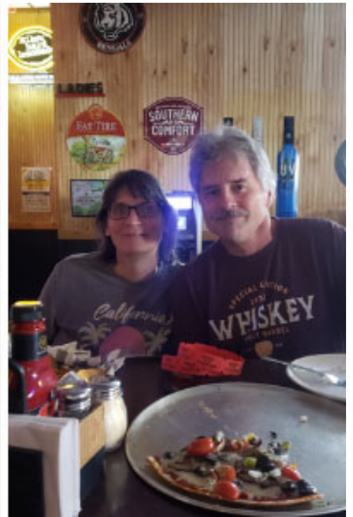
All the Yappy Hours