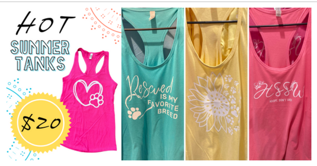
July Featured Items

Embrace the heat in style while making a statement in these racerback tank tops! Choose from 4 pet rescue-themed designs and bright summer colors, in sizes S-3XL. Available at HSSW for $20 while supplies last!