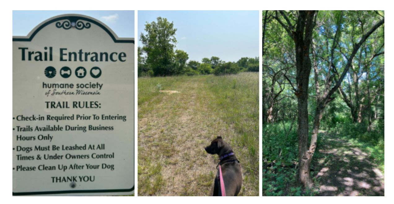
HSSW Trails = Happy Tails

HSSW has miles of beautiful, scenic trails throughout 44 acres of natural landscape and plant life! Trails Club Passes are available for purchase online or at HSSW for $5 per day, $20 a month, or $50 for the year. Also, adopters receive a $10 discount on a one-year pass at the time of adoption!