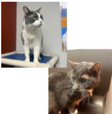
Bright Eyes & Charcoal